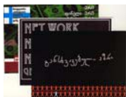
Alfami's postcards communicating messages about fundamental constitutional rights

At the end of December, Alfami, an IRIS grantee, published their first series of postcards communicating messages about fundamental constitutional rights. The postcards are intended to reach a wide audience and feature classical and modern Georgian artwork. There were 32 different postcards published; 16 depicting artworks of well-known classical painters and 16 depicting the works of modern artists. Creating the postcards, which involved learning and understanding fundamental human rights guaranteed by the