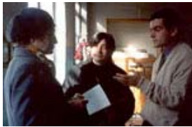
GYLA members providing free legal advice

GYLA's founders established the organization in order to improve the legal profession in Georgia. GYLA's activities are designed to meet the following goals: